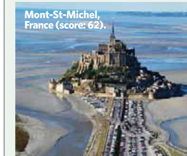
Mont-St-Michel, France (score: 62).

• SEE MORE COMMENTS on each of these destinations at www.nationalgeographic.com/traveler