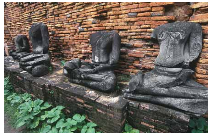
Poor management at historic sites in Ayutthaya, Thailand (score: 53), has paved the way for vandalism, including the beheading of Buddhas.

74. Maryland: Annapolis (SCORE: 63) The home port of the U.S. Naval Academy, on the Chesapeake Bay, is “full of charm and elegant 18th-century architecture.” Packs in folks seeking “maritime merrymaking.” Nearby, “you hit uninspired office buildings and car dealerships.”