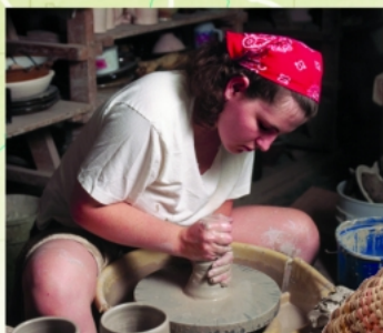
POTTERY MAKING AT BERKELEY COLLEGE.